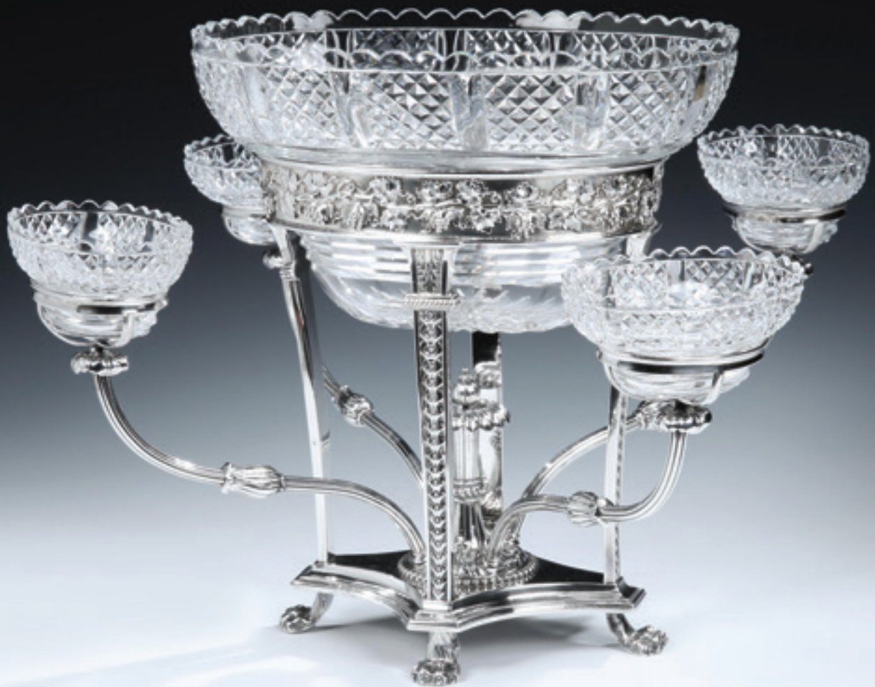
A fine Mathew Boulton silver and cut-glass Epergne with four reeded branches flanking central dish (the glass dishes are replacements), vine leaf and cluster decoration, 35cm high to top of central dish, standing on 4 claw feet, hallmarked Birmingham 1806, total weight of silver 2,539g: £14,000